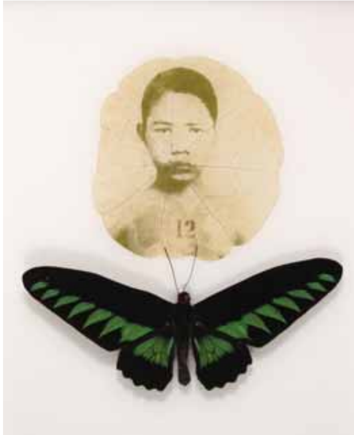
Iridescence of life #15 2008 12 x 10 inches Chlorophyll print on nasturtium, Rajah Brooke butterfly specimen, and resin