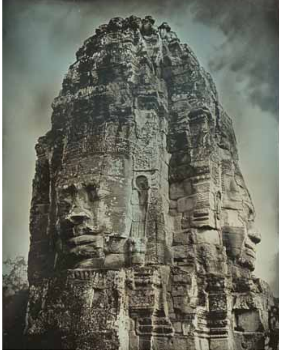
Buddhas of Bayon 2008 11.375 x 9.5 inches Daguerreotype