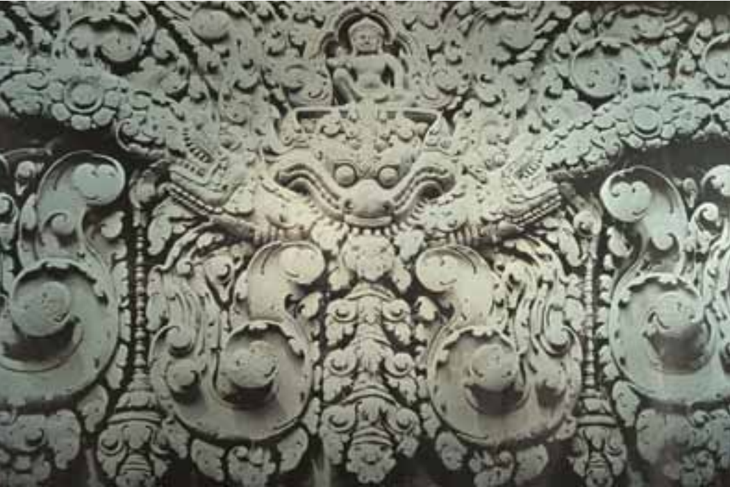
In the Eclipse of Angkor, Rahu carved in stone 2008 10.25 x 12 inches Daguerreotype