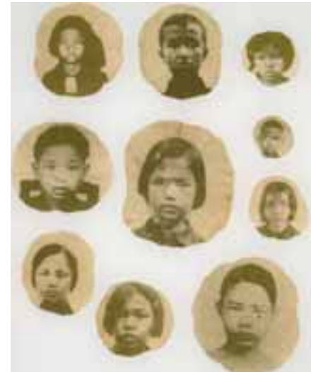
Memories of Tuol Sleng Genocide Museum #1 , 2008

In gazing at the subversively beautiful portraits of nameless victims, such as those in Transitional justice , 2008, the viewer acts as a witness in the larger historical context of the work.