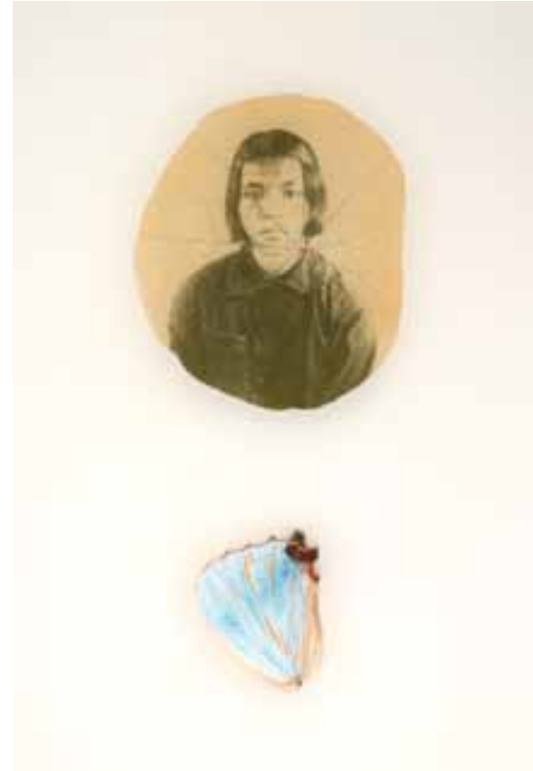
Iridescence of life #16 2008 12 x 10 inches Chlorophyll print on nasturtium, Morpho butterfly specimen, and resin