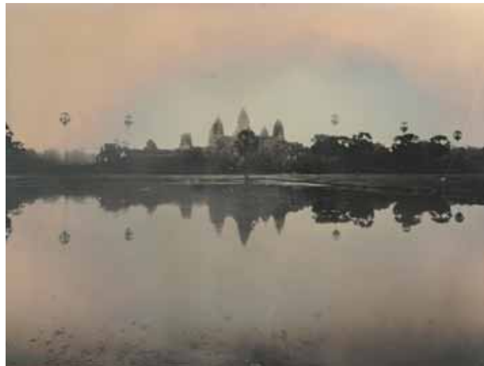
Angkor Wat 2008 13.25 x 16 inches Daguerreotype

Preceding pages: Ravana Shaking Mt. Kailasa, Banteay Srei, 2008 13.25 x 16 inches Daguerreotype