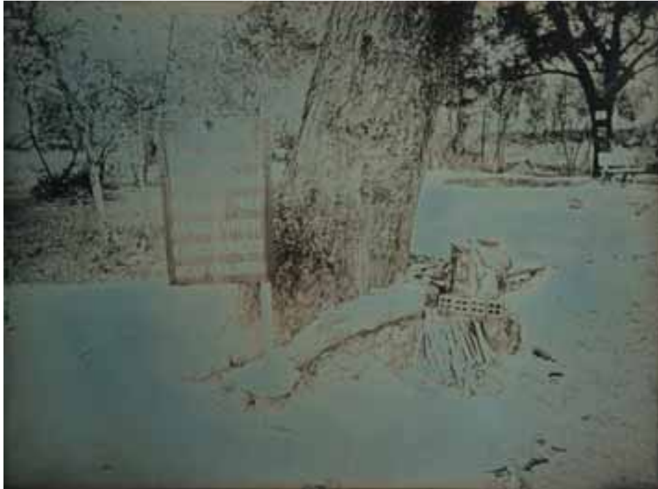
Killing Tree against which executioners beat children, Choeung Ek 2008 13.25 x 16 inches Daguerreotype