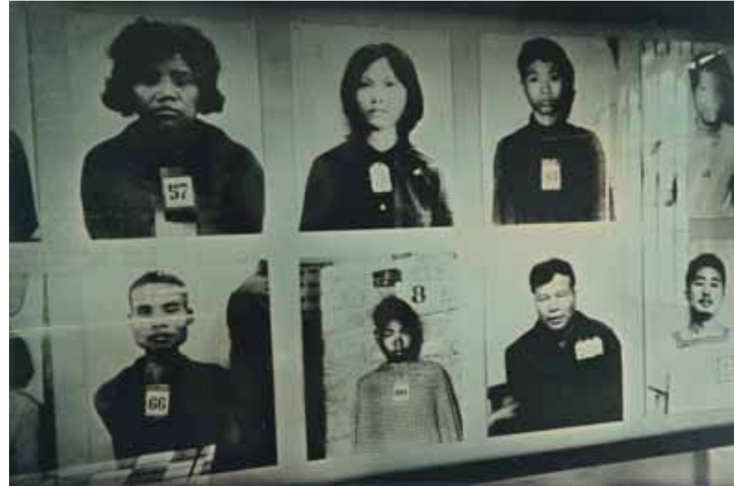
Portraits of Tuol Sleng Genocide Museum 2008 10.25 x 12 inches Daguerreotype