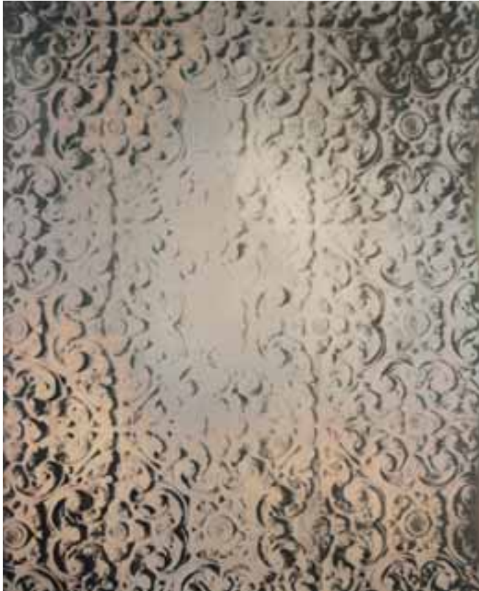
Wall pattern of Angkor 2008 25.5 x 21 inches Daguerreotype