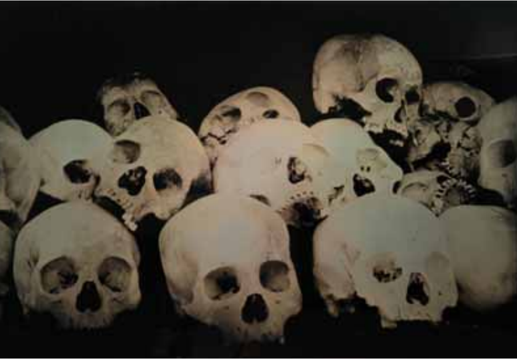
Human skulls on display in the memorial stupa of Choeung Ek 2008 17.5 x 23 inches Daguerreotype

The dead are able to live for a time in our minds and be part of the material world. And maybe somewhere in the far distance of our universe the atoms that once belonged to those people glow a little.” 3