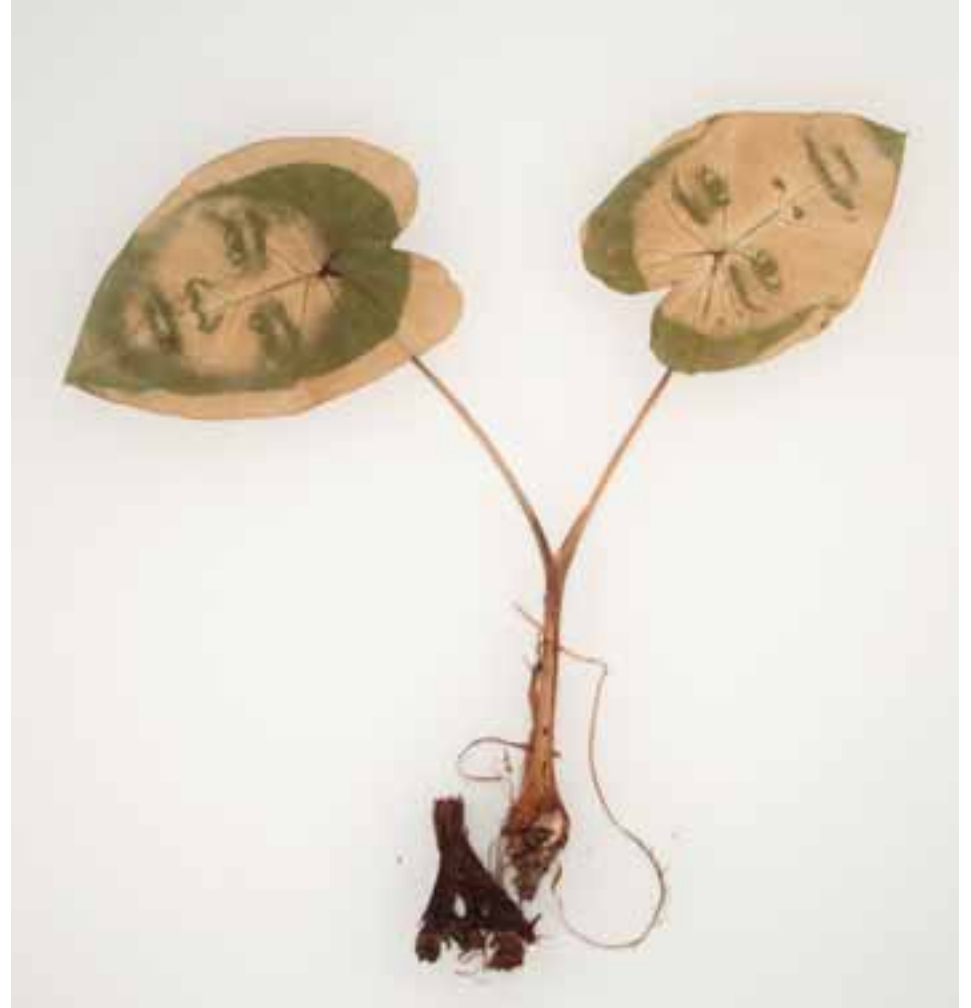
Transitional justice 2008 17 x 16.5 inches Chlorophyll print on elephant ear plant and resin